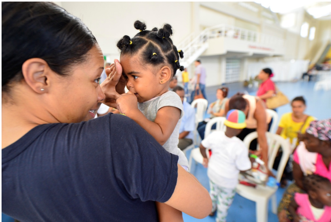
A hospital corpsman interacts with a young patient at a medical site during Continuing Promise 2015 in Santo Domingo, Dominican Republic. The exercise focused on humanitarian-civil assistance, subject matter expert exchanges, medical, dental, veterinary and engineering support, and disaster response to partner nations, showing U.S. support to Central and South America and the Caribbean.