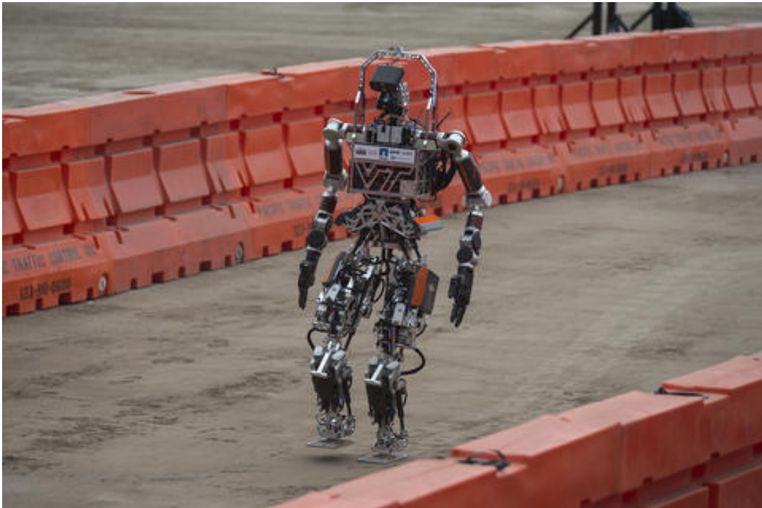
ESCHER, short for Electric Series Compliant Humanoid for Emergency Response, makes its way down the track during day two of the Defense Advanced Research Projects Agency Robotics Challenge (DRC). ESCHER was designed, fabricated, and assembled by engineering students at Virginia Tech.