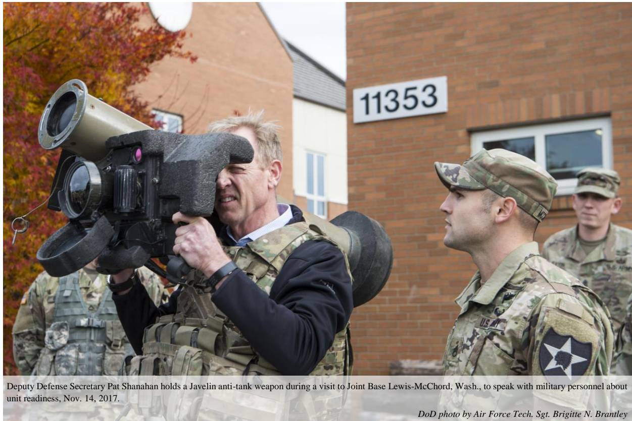
Deputy Defense Secretary Pat Shanahan holds a Javelin anti-tank weapon during a visit to Joint Base Lewis-McChord, Wash., to speak with military personnel about unit readiness, Nov. 14, 2017.