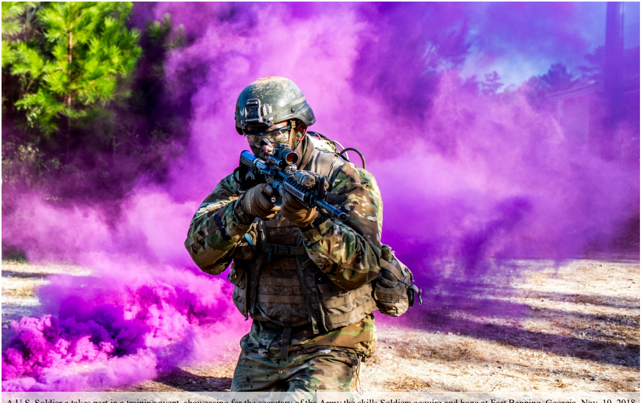
A U.S. Soldier a takes part in a training event, showcasing for the secretary of the Army the skills Soldiers acquire and hone at Fort Benning, Georgia, Nov. 19, 2018.