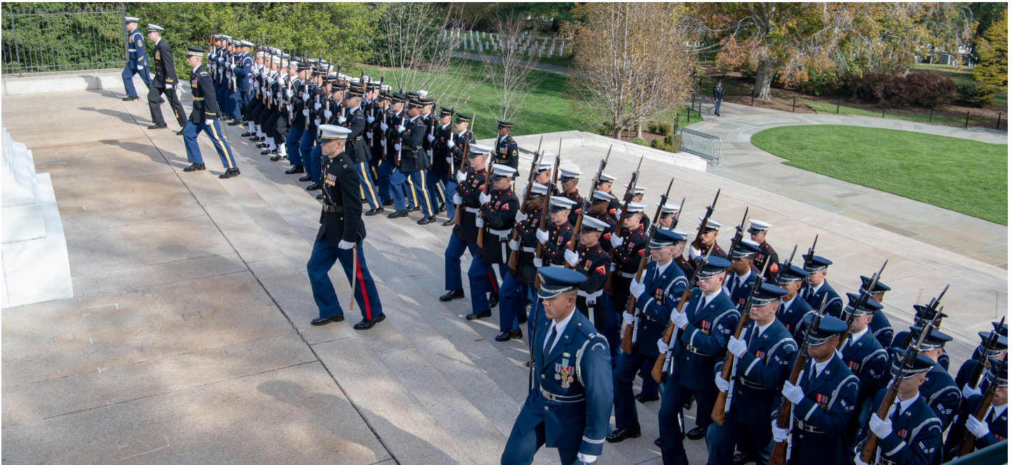
Service members of the Joint Honor Guard participate in a Presidential Armed Forces Full Honors Wreath-Laying Ceremony at the Tomb of the Unknown Soldier at Arlington National Cemetery, Arlington, Va., November 11, 2019.

The Army, Navy, and Marine Corps were established in 1775, in concurrence with the American Revolution. The War Department was established in 1789, and was the precursor to what is now the Department of Defense. The Coast Guard (part of the Department of Homeland Security during peace time) was established in 1790. The Department of the Navy was established in 1798. The National Security Act of 1947 renamed the Department of War as the Department of the Army, created the Department of the Air Force, and unified command of the Military Departments under the “National Military Establishment” headed by a Secretary of Defense. The Department of Defense Reorganization Act of 1958 established the Combatant Commands.