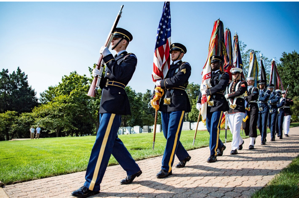
Service members conduct an Armed Forces Full Honor Wreath-Laying Ceremony at President William H. Taft's Memorial Gravesite in Section 30, Arlington National Cemetery, Arlington, Va., Sept. 15, 2022.

In 1775, the Continental Congress established three Military Services – the Army, Navy, and Marine Corps – to wage the Revolutionary War. Following ratification of the Constitution of the United States, Congress formed the Department of War in 1789, to administer the Army, and the Department of the Navy in 1790. Also in 1790, Congress established the Revenue-Marine, the predecessor of today's Coast Guard (which is now part of the Department of Homeland Security during peacetime). The National Security Act of 1947 split the Department of War into the Department of the Army and the Department of the Air Force. Further, the law unified the leadership of all three Military Departments under the National Military Establishment (NME), led by a Secretary of Defense who would be advised by the Joint Chiefs of Staff (JCS). The JCS, in turn, received the statutory authority to establish what today are known as Combatant Commands. The National Security Act Amendments of 1949 transformed the NME into the Department of Defense and created the position of the Chairman of the Joint Chiefs of Staff. Over time, the Department has consolidated certain common functions into Defense Agencies and Department of Defense Field Activities. In 2019, Congress established the newest Military Service, the Space Force, under the Department of the Air Force.