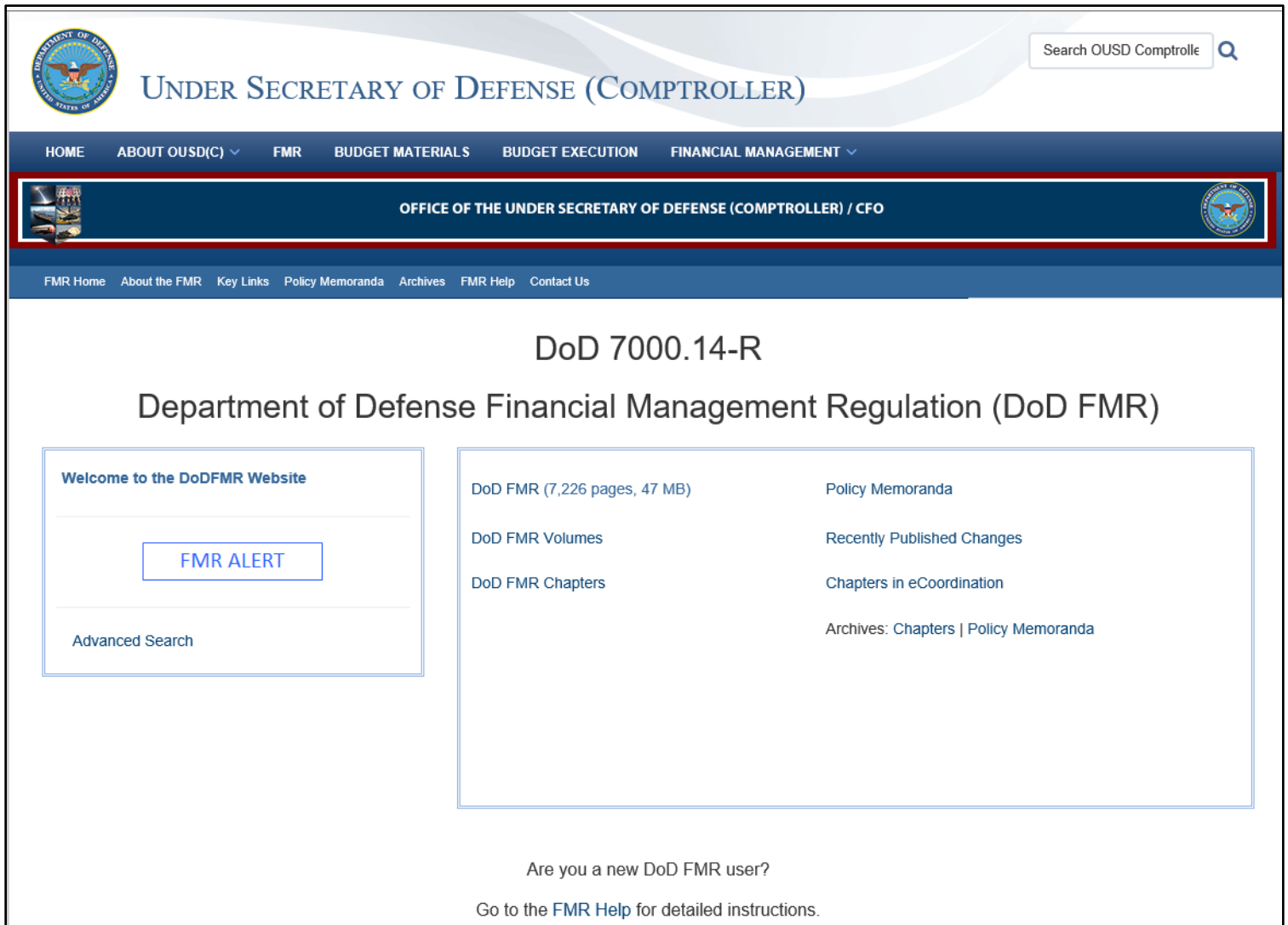
Figure 1. DoD FMR Home Page